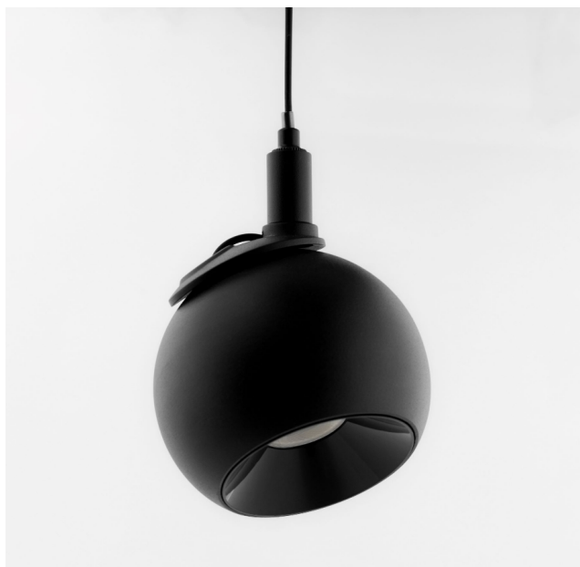
Magnetic LED light to be installed on 48 V magnetic track