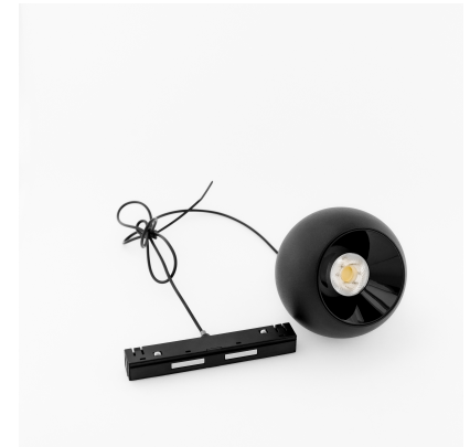
Magnetic LED light to be installed on 48 V magnetic track