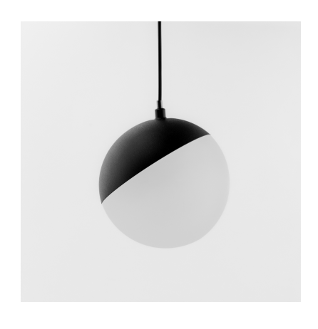
Magnetic LED light to be installed on 48 V magnetic track