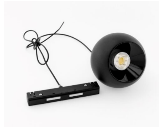
Magnetic LED light to be installed on 48 V magnetic track