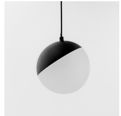
Magnetic LED light to be installed on 48 V magnetic track